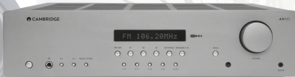
AXR85 FM/AM STEREO RECEIVER