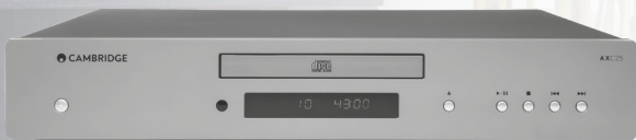
AXC25 CD PLAYER