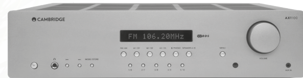
AXR100 FM/AM STEREO RECEIVER