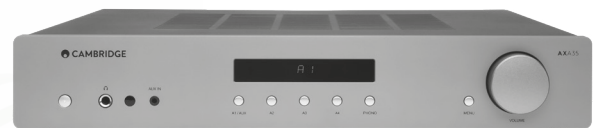
AXA35 INTEGRATED AMPLIFIER W/ BUILT-IN PHONO-STAGE