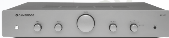
AXA25 INTEGRATED AMPLIFIER